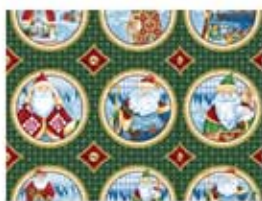
21087 F 2 3/4 yard