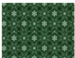
21094 F 1/2 yard