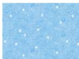
21095 B 5/8 yard