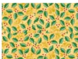
21093 S 3/4 yard