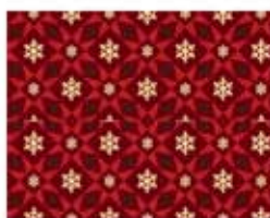
21094 R 1 yard