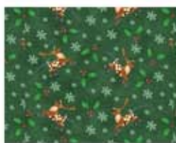
21091 F 5/8 yard