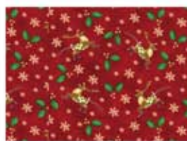
21091 R 1 1/8 yard