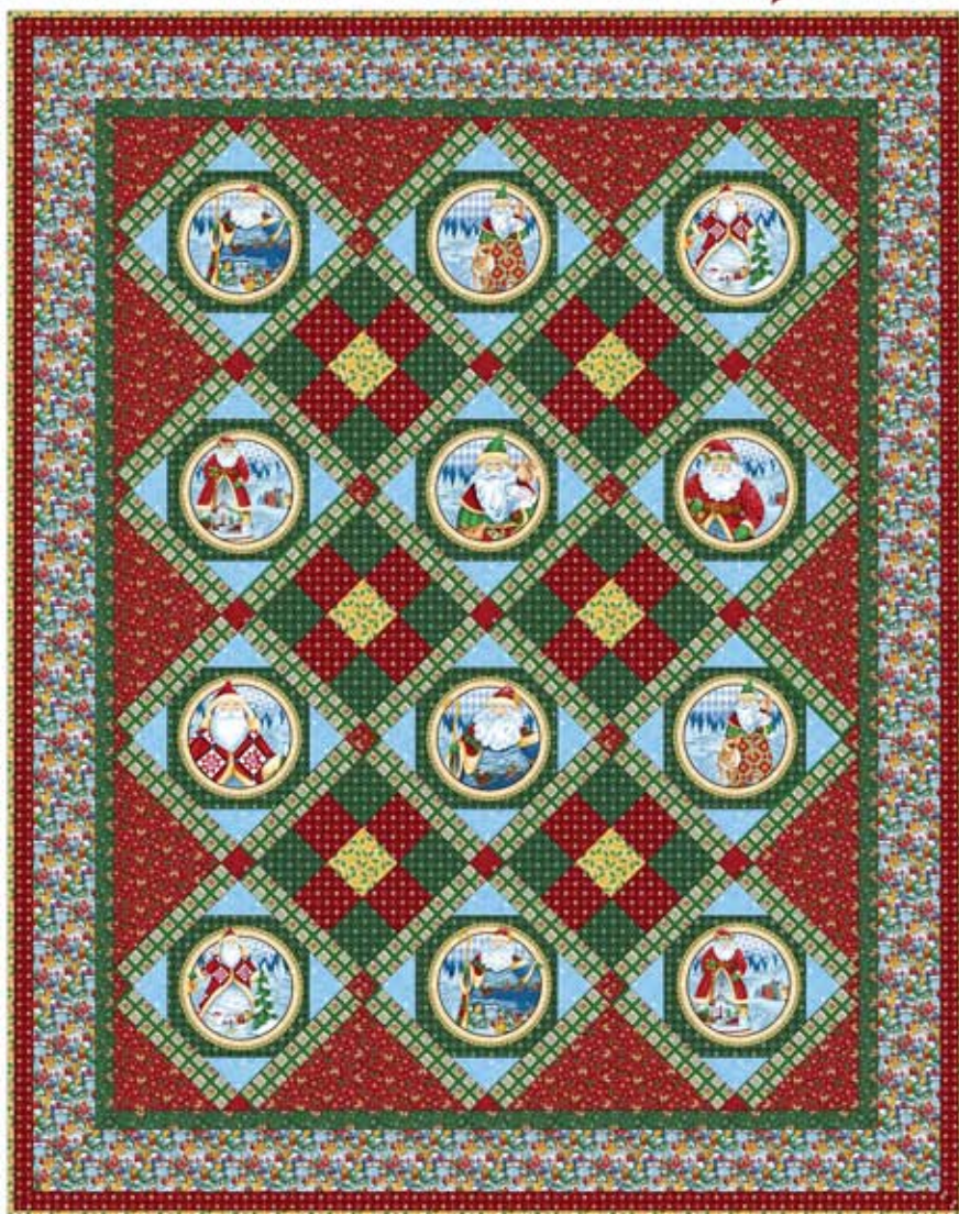
Finished Size: 76" x 96"