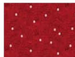
21095 R 1/4 yard