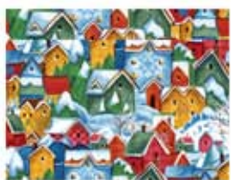
21089 R 1 1/8 yard