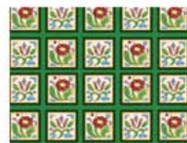
21092 G 1 1/8 yard