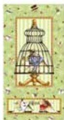
20986-G 1 panel

Approximate Finished Size: 56" x 76", including prairie points