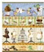
20987-EB 2 1/4 yd.