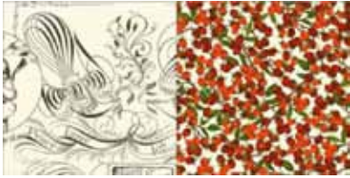
Cut 24 Segments