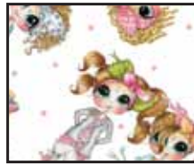
23493 Z also binding