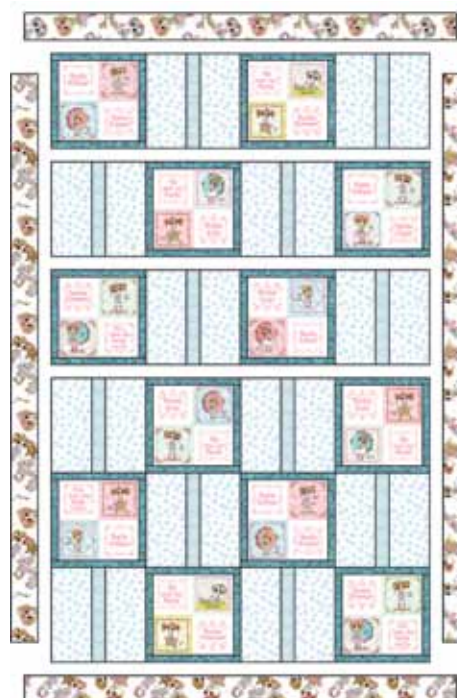
Quilt Layout Diagram