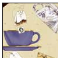
22419 E (Backing)