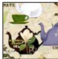
22418 E (Backing)