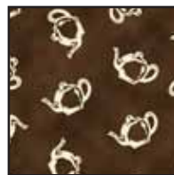
22421 A (Binding)