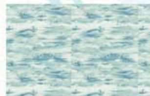
21103 KG 1 yard