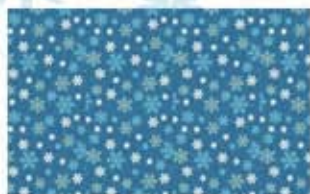
21104 B \frac{1}{2} yard