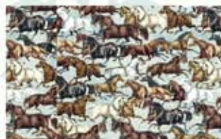
21101 KG \frac{2}{3} yard