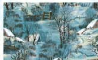
21099 B 3\frac{1}{3} yard