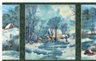
21097 F 1 panel