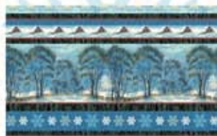
21102 B 1\frac{1}{3} yard