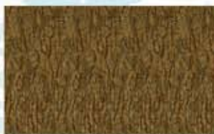
21105 A 1 yard