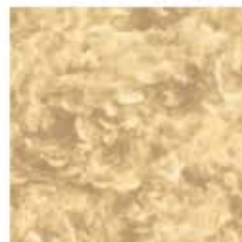
20813 E ½ yard