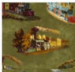
20809 G ½ yard