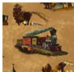
20809 S ¾ yard