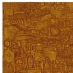
20812 T ⅓ yard