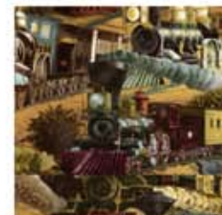
20808 SJ 5 yards