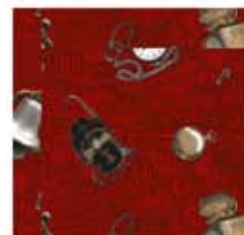
20811 R 1 ½ yards