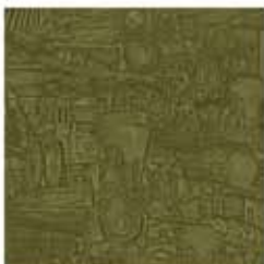
20812 G ½ yard