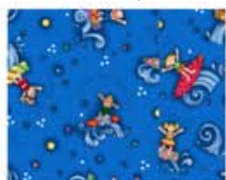
20746-B ¼ yd