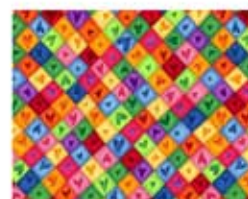
20749-R 1½ yd