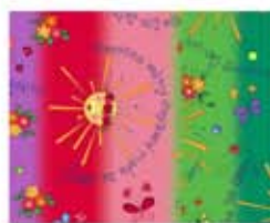
20743-G ¼ yd