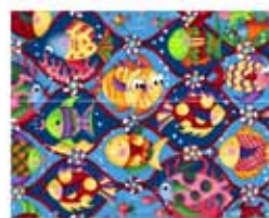
20744-B ¼ yd