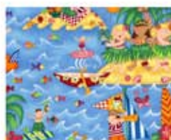
20747-B ¾ yds