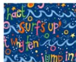
20745-B 1¼ yds