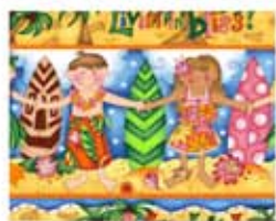
20742-S ¼ yd